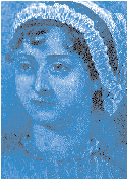
Portrait of Ms. Jane Austen, whose works are currently airing as a series of TV movies on PBS.

very popular Pride & Prejudice went into its third printing. It was Henry, from his sickbed, who successfully negotiated an agreement with a publisher for her fourth novel, Emma . After an agreement had been secured, Jane went up to London to