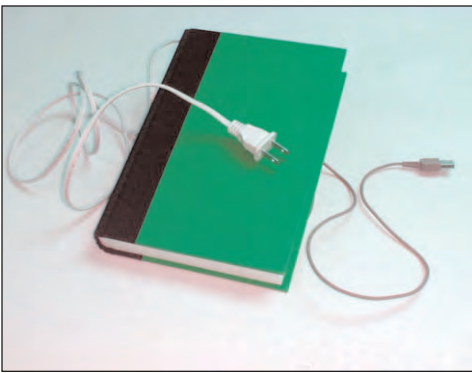
Electronic forms of books have become much more popular in recent years.

major distribution channels established for ebooks, including Fictionwise and Mobipocket.